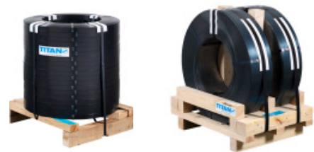
Packing Steel Strap